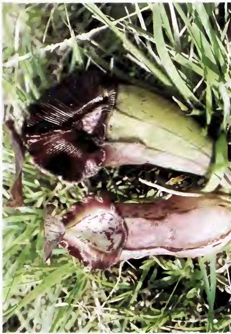
New Nepenthes species from G. Pangulubao Sumatra